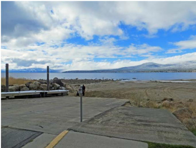
COON STREET BOAT RAMP 2015