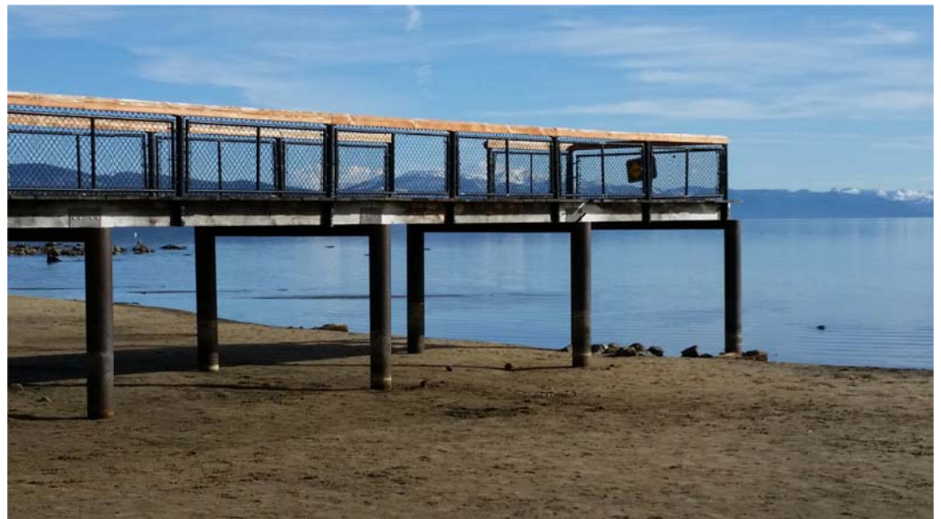
KINGS BEACH PIER 2015